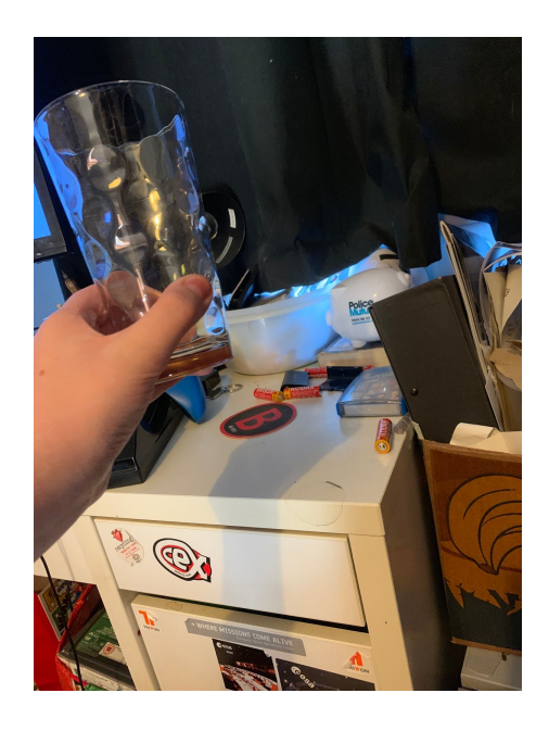
[BF] Leah, 9:18:15 AM